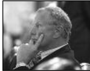
State Senator Raymond Lesniak

The Star-Ledger reports State Senator Ray Lesniak’s ex-chief of staff pleads guilty to failing to file tax returns.