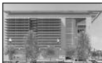
New Union County Courthouse rendition

County Watchers report the county is building a $45 million courthouse, although the County is under no obligation to do so.